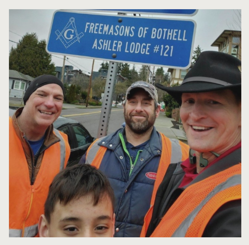
Here are the dates we have set up for the rest 2023 O # O O ):

Please join us to get some exercise, keep our streets looking neat, and have some good fellowship with other Brothers.